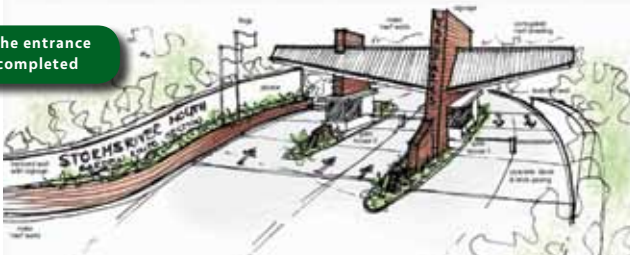
Sketch of the entrance gate once completed

Also, with the warmer weather one can usually expect snakes. Ask Senior Section Ranger, Riaan Nel, who was a real hero to the local community when he managed to catch an almost six foot Cape Cobra in one of the housing complexes in Beaufort West on 27 October. The Cobra slithered over a six foot pre-fab wall into the next property, from where a set of birds alerted him of the snake's whereabouts near the dog kennel. He successfully caught the snake and released it into the Park.